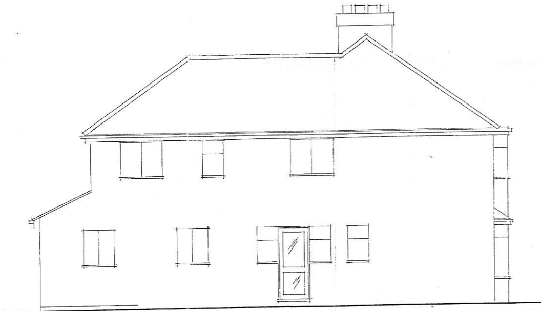
Side Elevation As Proposed

Proposed Extension 1 Hoadly Road Cambridge For Mr. & Mrs. P. Zaffaroni